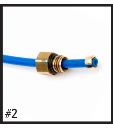
SLIDE THE THREADED PORTION UP THE LINE AND SPREAD THE COLLET OPEN TO REMOVE